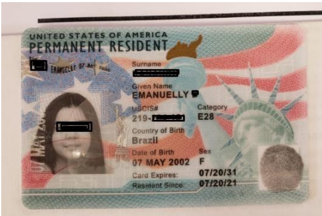
VISTO EB-2 NIW – GREEN CARD – FILHA DE ENFERMEIRA