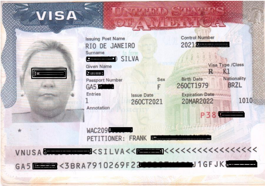
VISTO K-1 – NOIVA