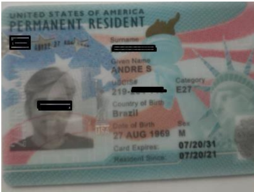
VISTO EB-2 NIW – GREEN CARD – ESPOSO DE ENFERMEIRA