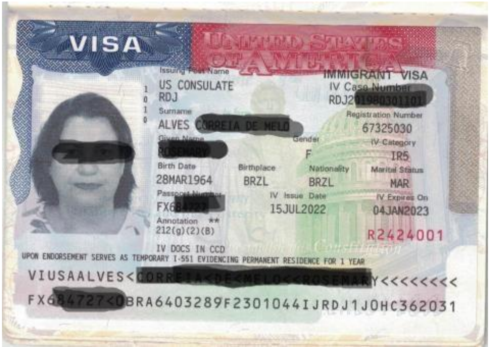
VISTO DE FAMILY REUNION – FILHO PARA MÃE - APROVADO PARA PEGAR O GREEN CARD NOS EUA