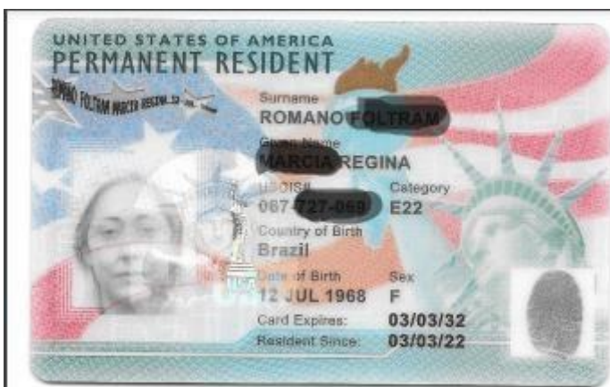
GREEN CARD – ESPOSA PILOTO DE AVIÃO – VISTO EB-2 NIW