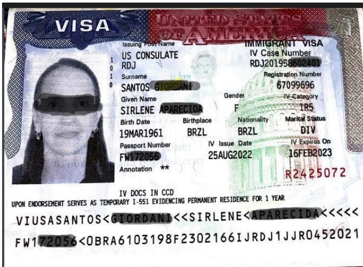
VISTO DE CASAMENTO PARA ENTRAR NOS EUA E RECEBER O GREEN CARD