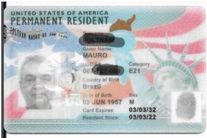
GREEN CARD – PILOTO DE AVIÃO – VISTO EB-2 NIW