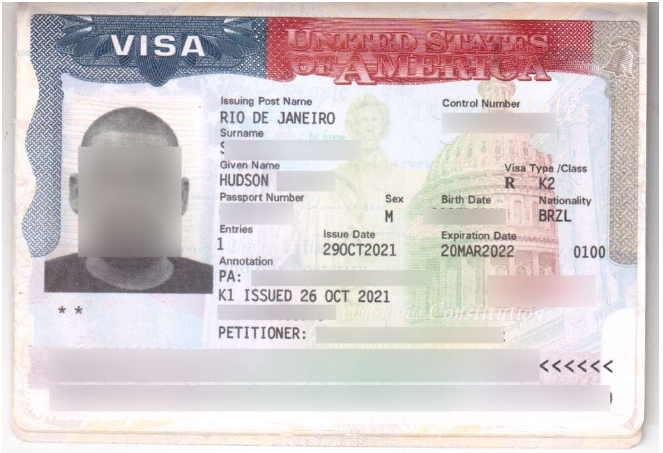
VISTO K-2 (DEPENDENTE CASAMENTO) - GREEN CARD