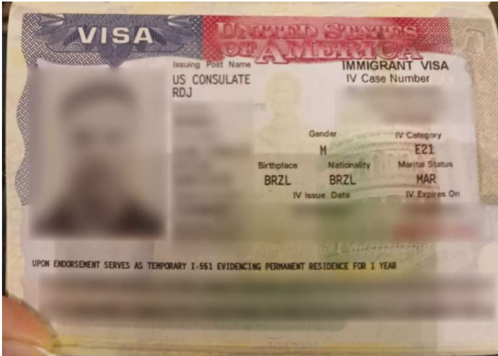
VISTO EB-2 NIW - GREEN CARD - ADMINISTRADOR