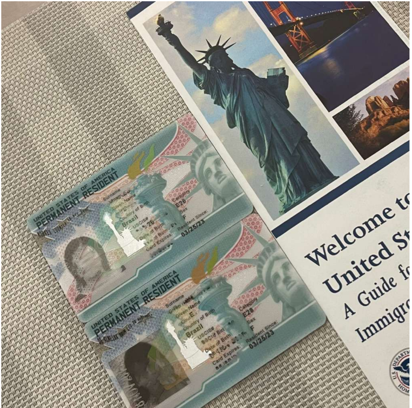
VISTO EB-2 NIW - GREEN CARD - ODONTÓLOGA E DEPENDENTE (FILHA)