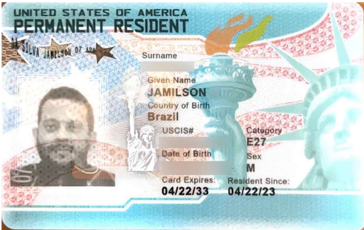
VISTO EB-2 NIW (E27) - GREEN CARD - CÔNJUGE DE PEDAGOGA