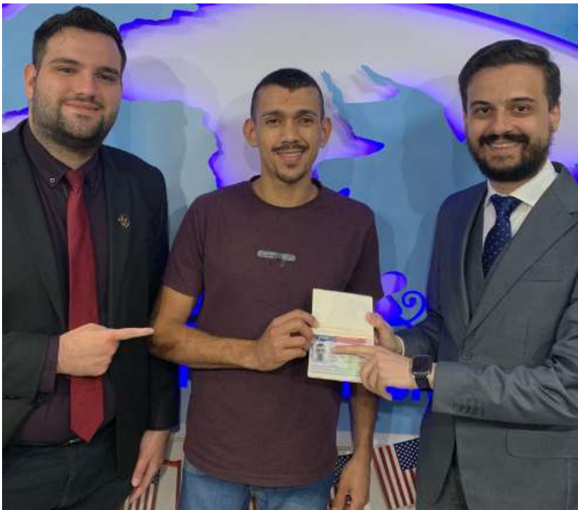
VISTO K-3 (CASAMENTO) - GREEN CARD (+ K-4 FILHO DO CÔNJUGE DE CIDADÃO AMERICANO)