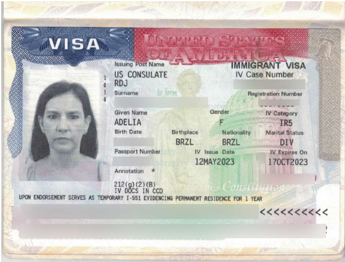
FAMILY REUNION (IR5) + PROCESSO DE WAIVER (PEDIDO DE PERDÃO) - GREEN CARD