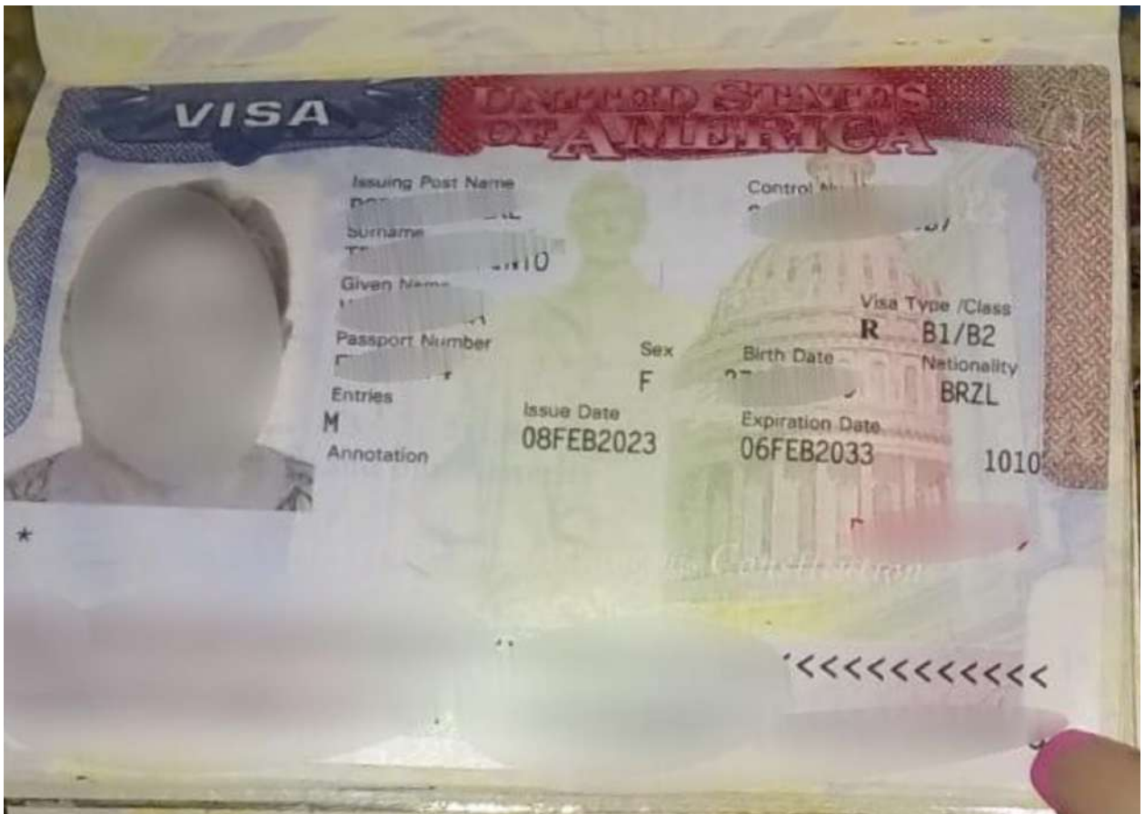
VISTO B1/B2 (TURISMO)