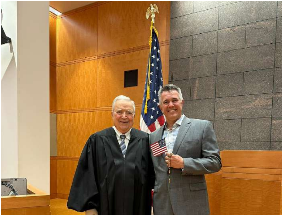
PROCESSO DE NATURALIZAÇÃO - CIDADANIA AMERICANA