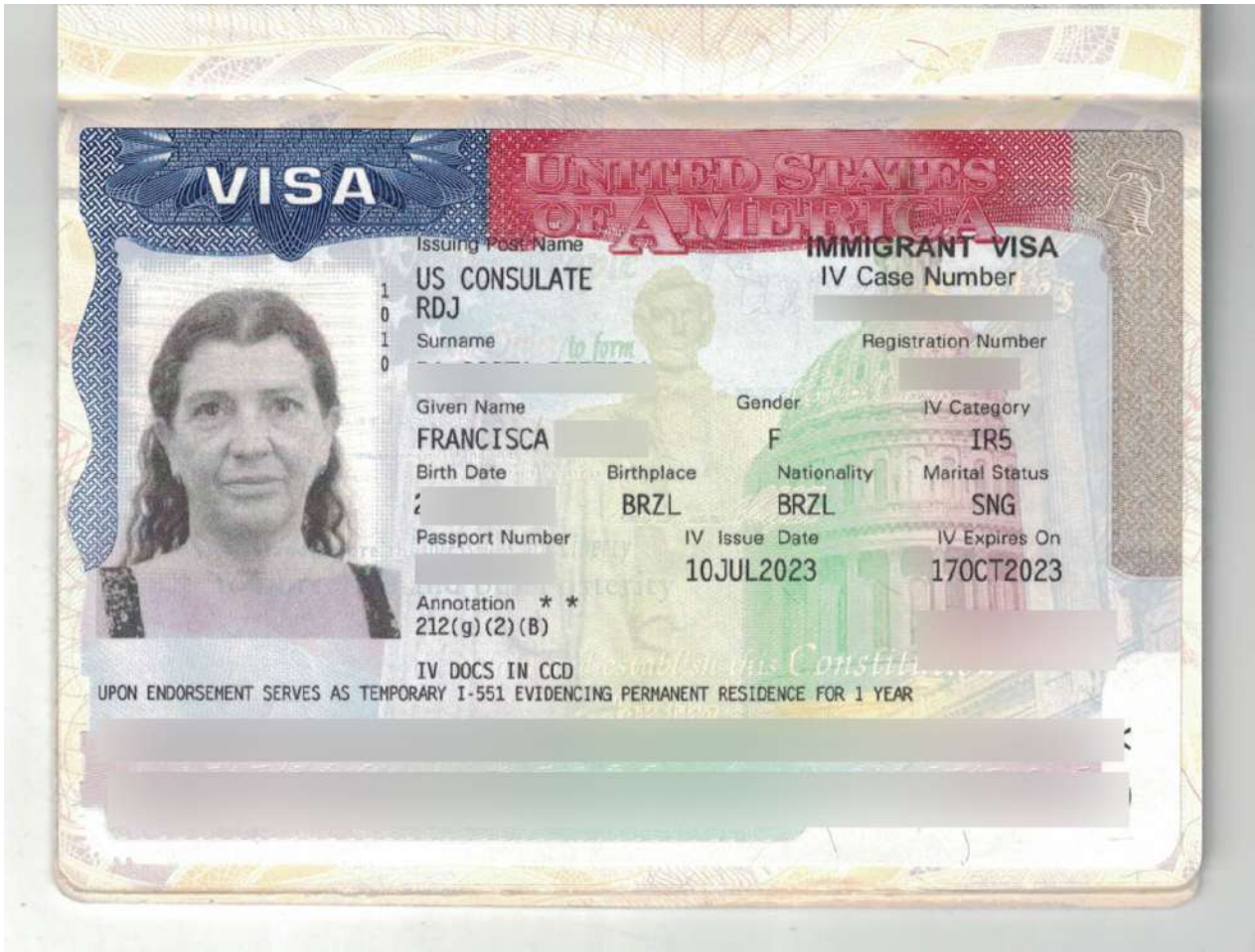
FAMILY REUNION (IR5) + PROCESSO DE WAIVER (PEDIDO DE PERDÃO) - GREEN CARD