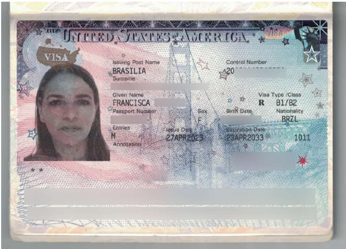
VISTO B1/B2 (TURISMO)