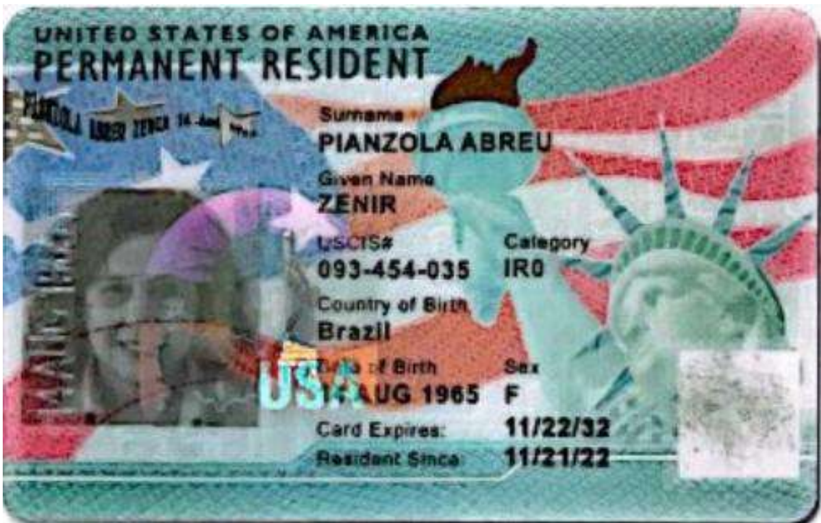
FAMILY REUNION (FILHO AMERICANO PARA OS PAIS) + PROCESSO DE WAIVER (PEDIDO DE PERDÃO) - GREEN CARD