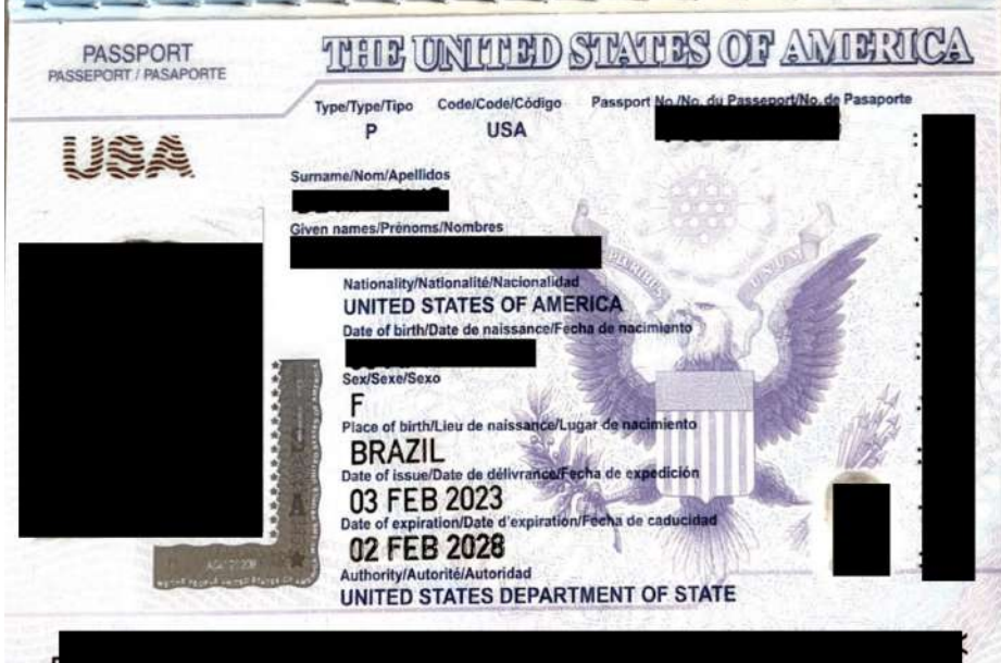
CRBA (Registro Consular de Nascimento no Exterior)