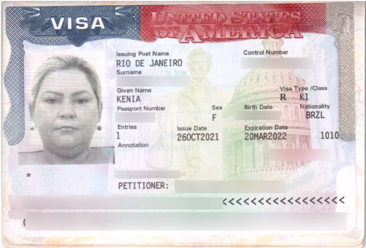
VISTO K-3 (CASAMENTO) - GREEN CARD