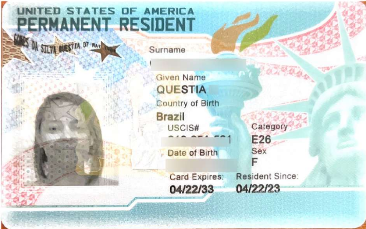
VISTO EB-2 NIW - GREEN CARD - PEDAGOGA