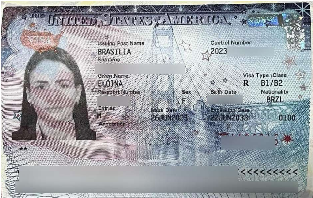
VISTO B1/B2 (TURISMO)