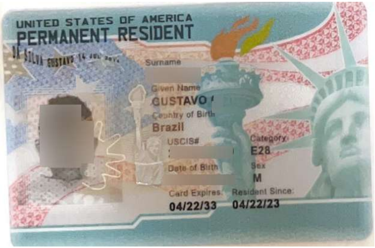
VISTO EB-2 NIW (E28) - GREEN CARD - FILHO DE PEDAGOGA