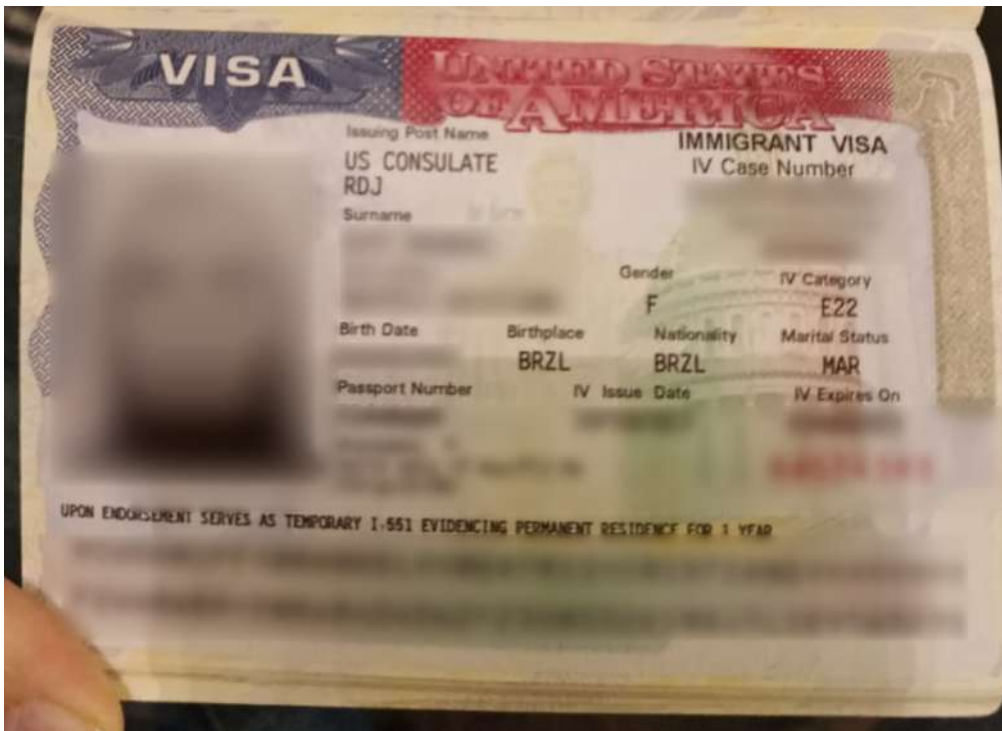
VISTO EB-2 NIW - GREEN CARD - CÔNJUGE DE ADMINISTRADOR