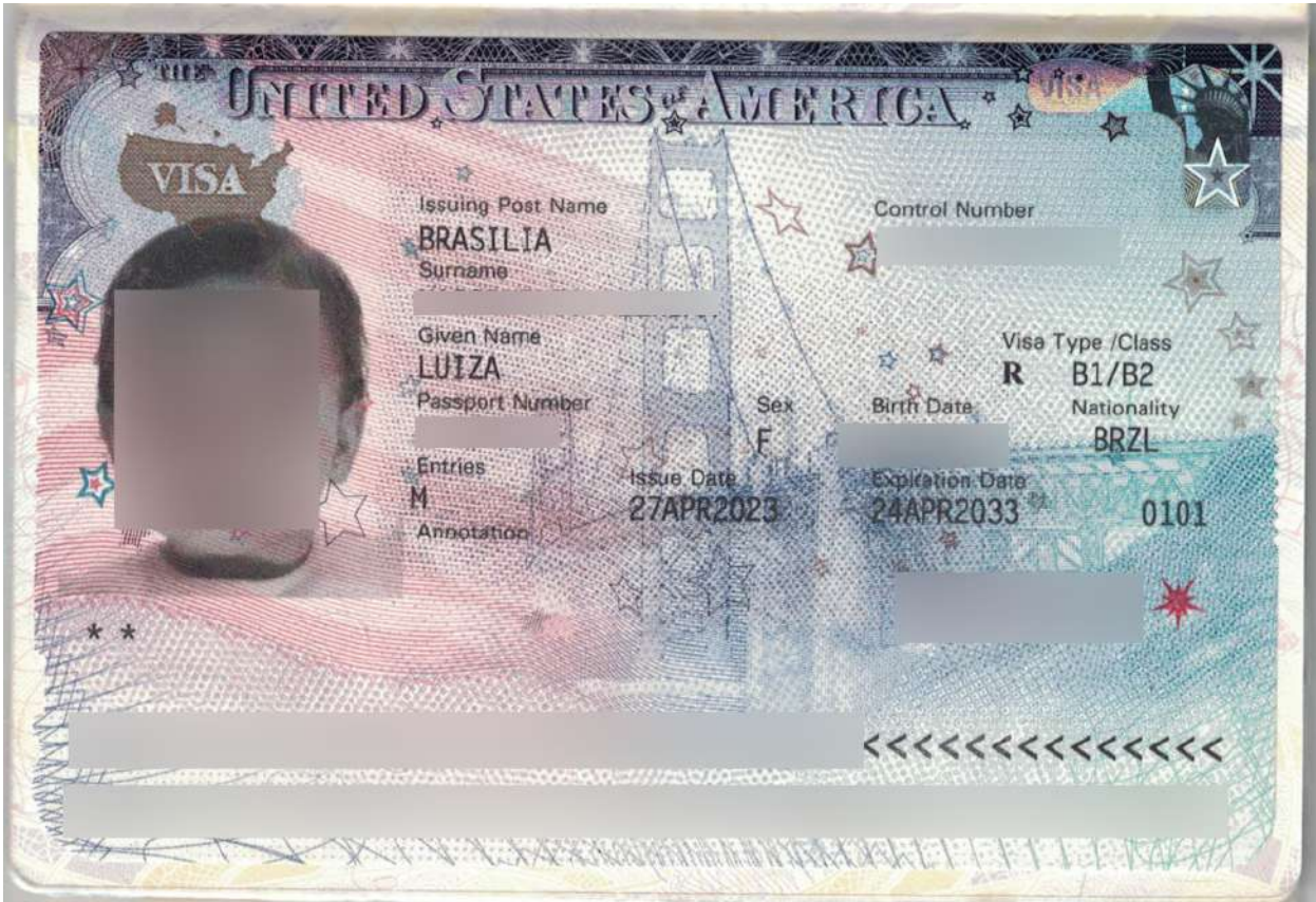
VISTO B1/B2 (TURISMO)