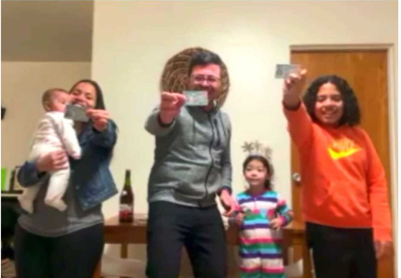
VISTO EB-2 NIW - GREEN CARD - TEÓLOGO (+ DEPENDENTES)